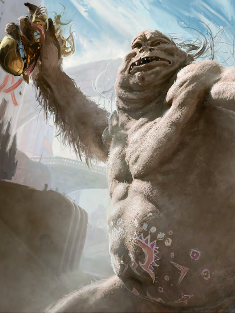
Enraged Giant ■ Anthony Palumbo

Any structure built along one of their migratory paths is sure to be destroyed unless special accommodations are made. The zone of Giant's Walk in Ghirapur was designed by the city's engineers and edificers to include such accommodations, including rotating platforms, shifting bridges, and adjustable canal locks that provide the giants a clear and easy pathway during their biannual migration through the city.