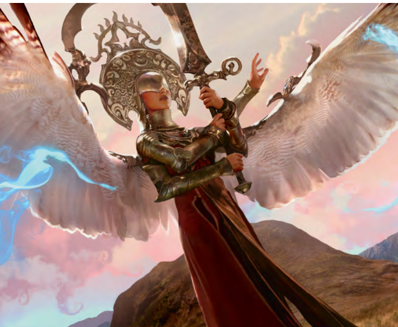
Exquisite Archangel — Brad Rigney