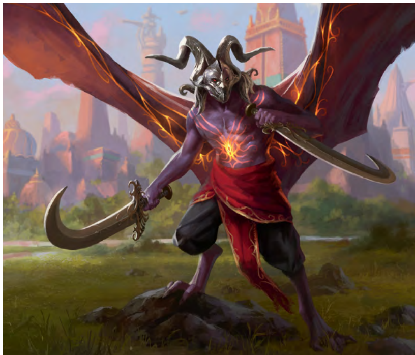
Demon of Dark Schemes — Daarken

The statistics of an erinyes work well for demons on Kaladesh, but their weapons deal extra necrotic damage rather than extra poison damage.