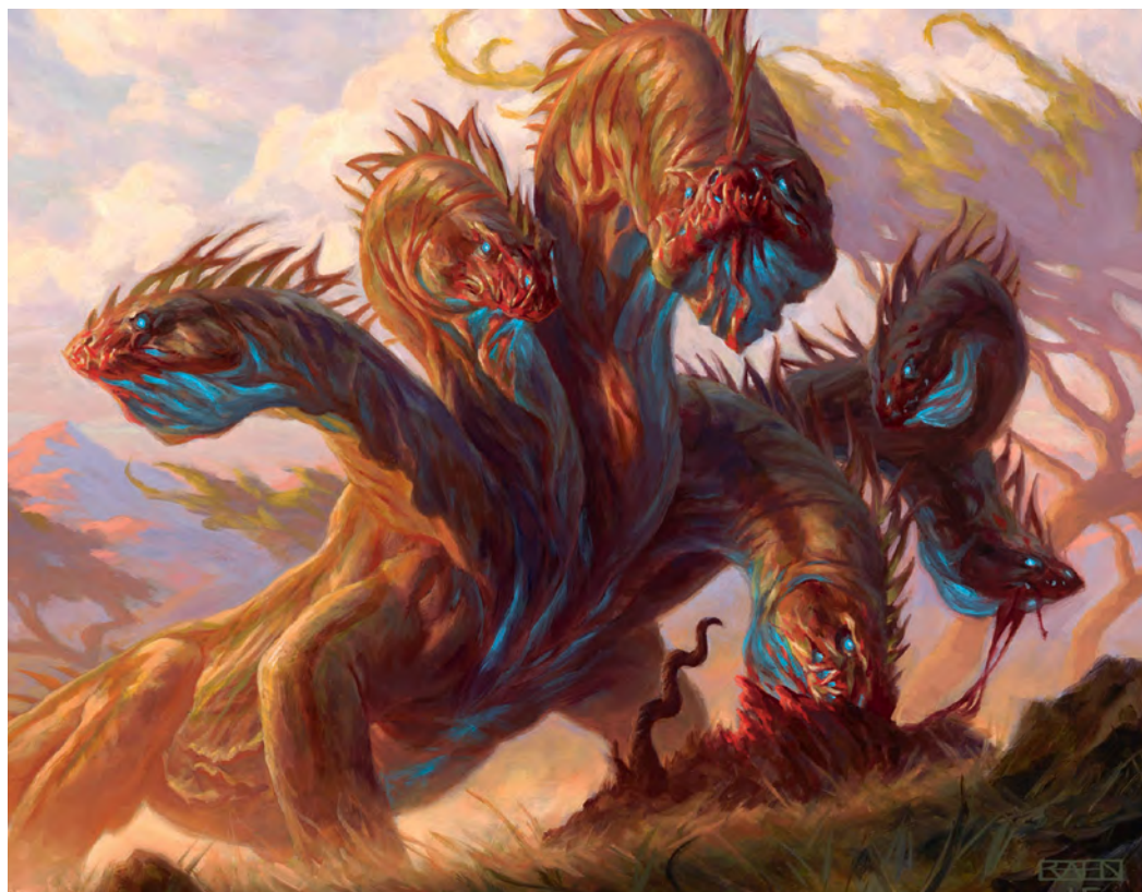
Bristling Hydra ■ Chris Rahn

Giants eat whatever they happen across in the course of their migrations, which includes many other creatures drawn to the aether flow. They are beings of pure aggressive instinct, but without a hint of malice. In all likelihood, giants aren't intelligent enough to wish harm on anyone or anything. Still, the combination of their regular migrations and their sheer destructive power makes these creatures a menace.