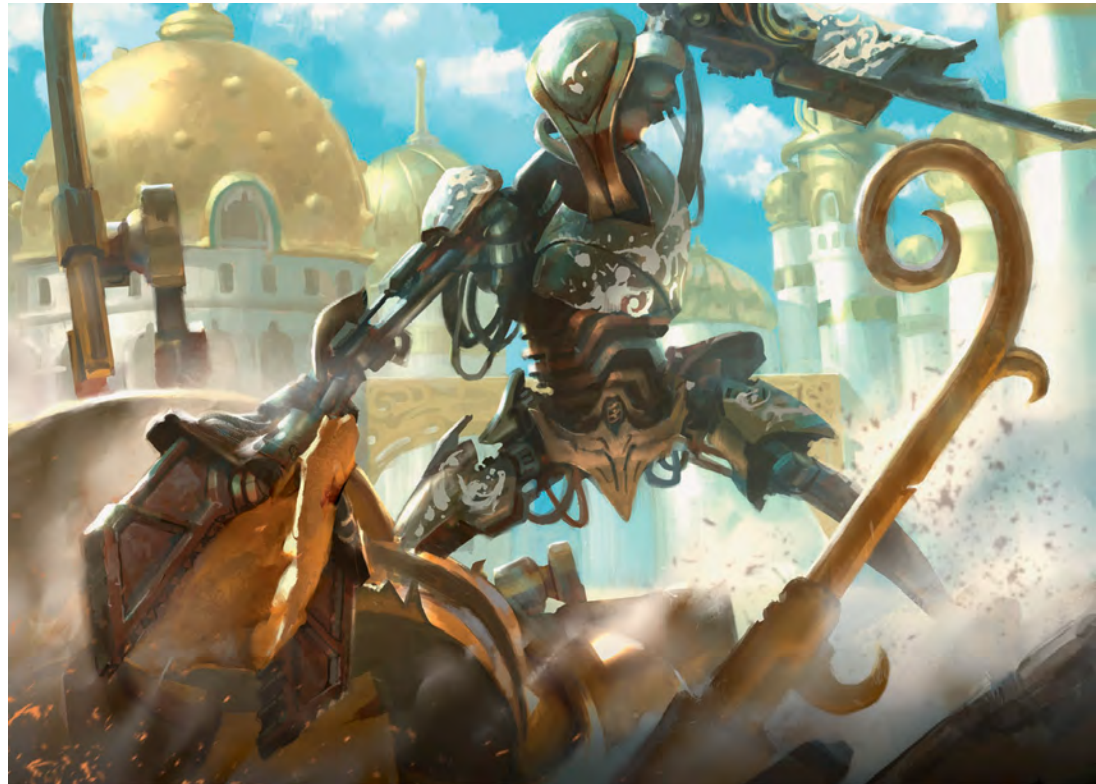
Prizefighter Construct © Daniel Ljunggren

Almost any creature in the Monster Manual with the construct type could be used as a construct on Kalandesh, including animated armor , helmed horrors , shield guardians , and modrons .